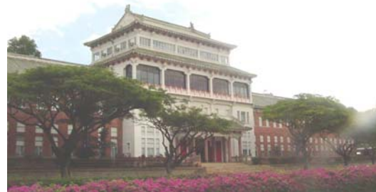
Old Nanyang University Library & Administration Building