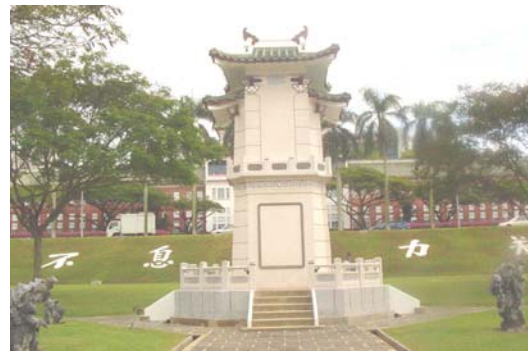
Old Nanyang University Memorial