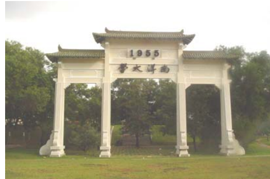
Old Nanyang University Arch